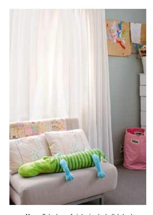
Above Splashes of pink give Isabella's bedroom a girly touch, though the decor could easily be transformed into a little boy's room. Right Team crisp white linen with restful colours such as Resene 'Lemon Grass'. Below Don't forget to add artwork and splashes of bright colour to enliven a child's room.